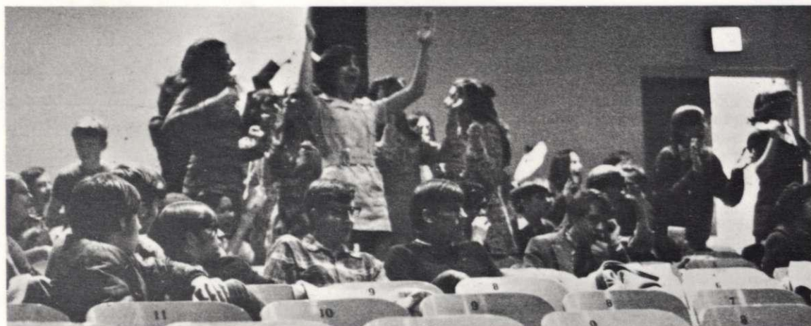
Rebel backers whoop it up when the announcement is made that South speech team is the 1971 sectional winner.