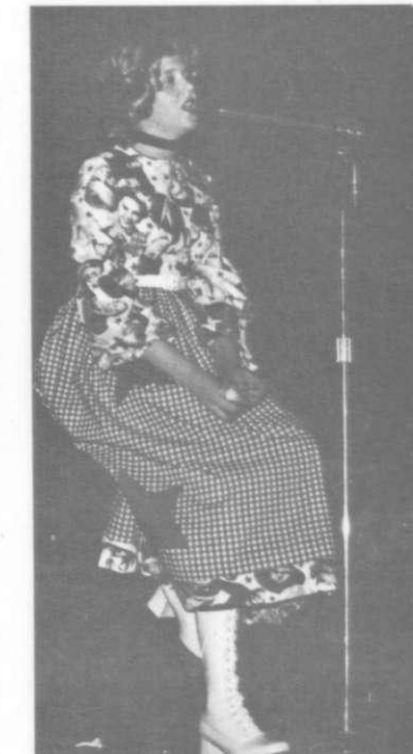
Second place winner at the

GOOD GROOMING SCORED Some 400 years ago, William Shakespeare said, "Apparel oft proclaims the man." It makes as much sense now as it did then. Expert observers have long seen a correlation between eccentric dress and eccentric behavior--sloppy appearance and sloppy thinking--lavishness