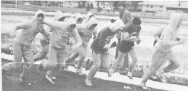
Members of the track team get into condition for their long season that will open today against DD Eisenhower, Blue Island.