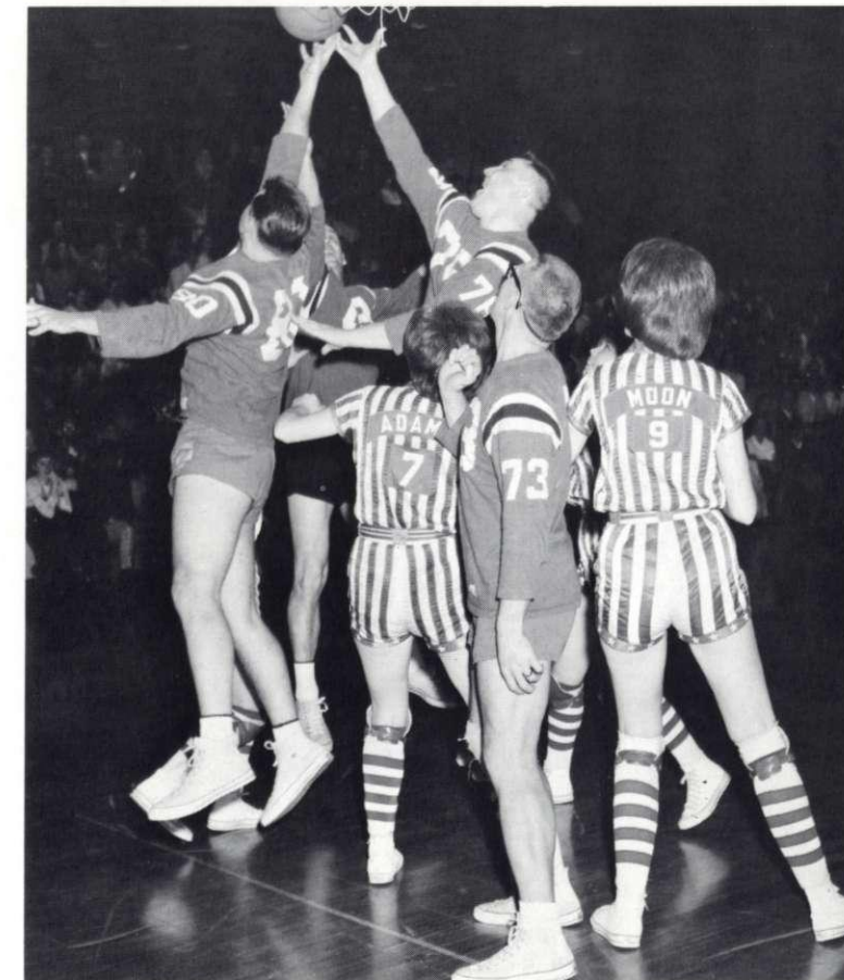
In late February of 1968, Parents Club sponsored a basketball game between the All-American Redheads and the faculty of South. The purpose of the game was to raise money for the after-prom party that Parent's Club sponsors.